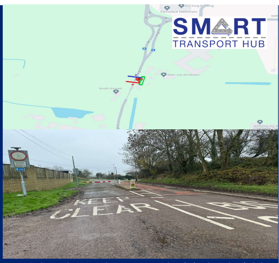
STH carried out a 7-day ATC on High Street commencing the 07/12/23. The number of vehicles exceeding the speed limit of 30mph was 267 which is 22.29% of the total vehicles recorded in both directions which was 1198.